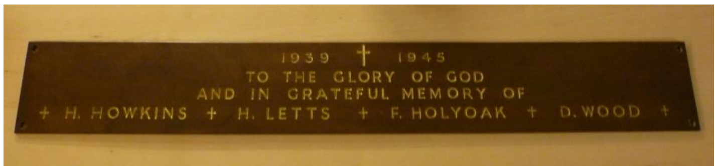
Wesleyan Methodist Church Memorial