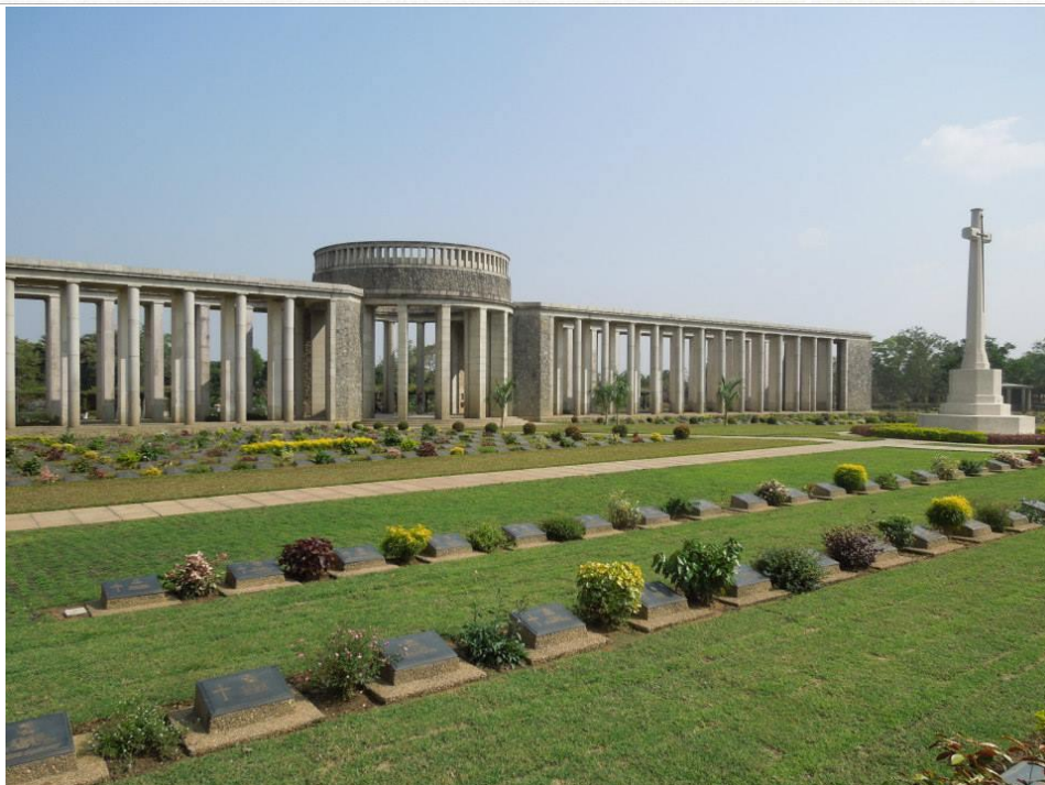
Taukkyan War Cemetery

And I thank God and all the support staff, for me being well and able to make it such a memorable pilgrimage, one which I shall never ever forget.